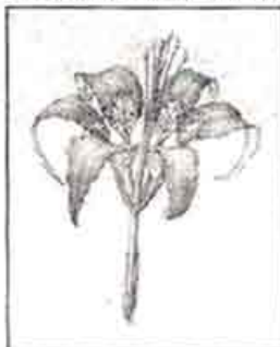
'Pine Lily,' left, and 'Warblers,' below, are graphite-on-Bristol-board works; each measures 11 by 14 inches; $500 each.

For more information on the exhibit, contact Diane Arrieta at (561) 799-8530 or darrieta@fau.edu