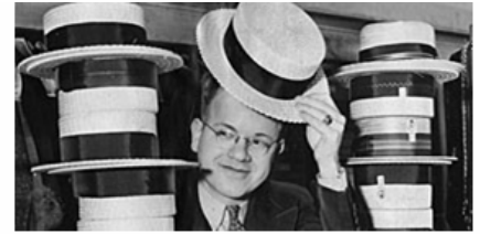
These historic photos have emerged from deep in the archives of the Chicago Tribune and are featured in our Sunday Magazine. In an earlier incarnation, these photos appeared on the Flashback page -- and each photo is truly a flashback to the past.

Summer Jam Concert Great Seats, Cheap Prices. Buy Summer Jam Tickets Now! www.TicketSpot.com