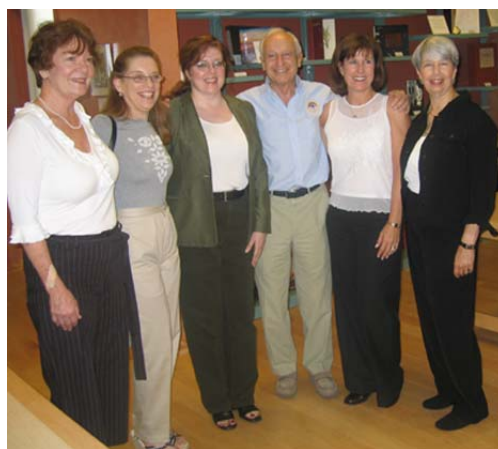
For the Love of Books 2003 Award Ceremony